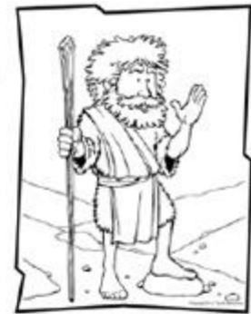
JOHN THE BAPTIST